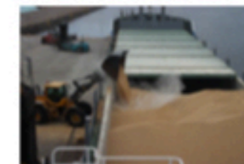
International Export of Biofuels