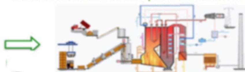
Boiler and Steam Turbine Power Plant