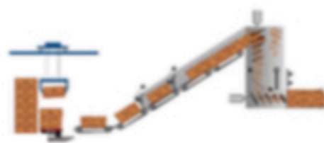
Unloading & Feeding System