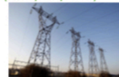
Electricity Export to National Grid CEB