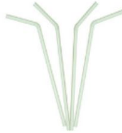
PLA Bio Plastic