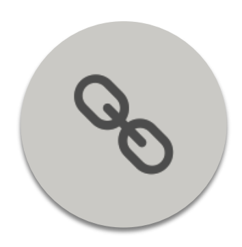
Suspicious supply chains