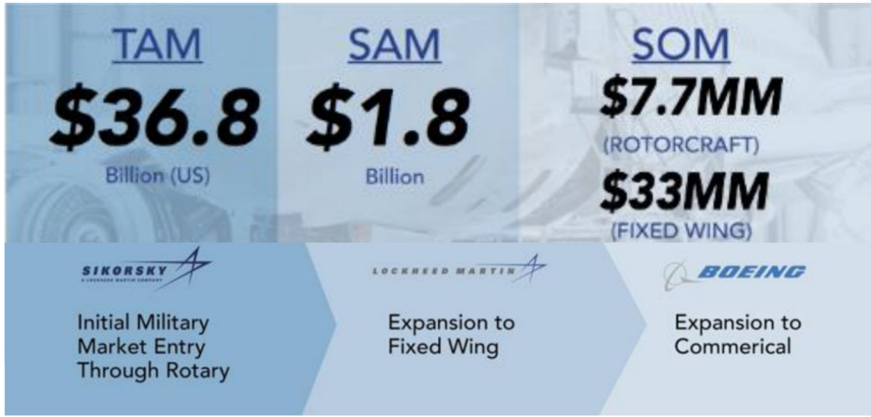
Figure 4. Scale potential.