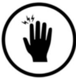
RSI IN WORKFORCE

UAT is creating a sensor network for electrical wiring that is designed to reduce weight, improve safety, and simplify maintenance through the use of Augmented Reality and Artificial Intelligence. The aviation industry has focused on modernizing their fleets both in the military and commercial sectors. Aging aircraft wiring is a predominant problem for aviation. The issues illustrated in Figure 1, are the problems UAT has focused on solving by replacing the metal clamps used today for the Smart Interconnecting Clamp for aircraft wiring management.