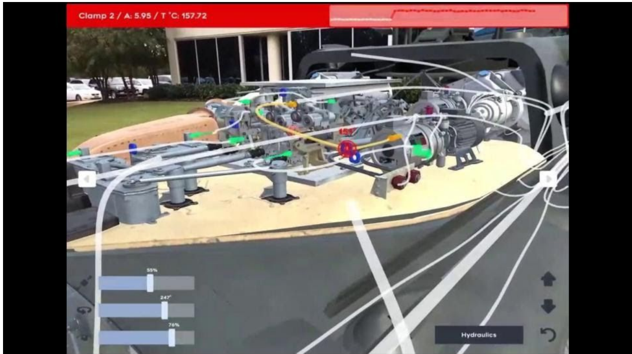
Figure 3. Sensor Network embedded in Smart Interconnecting clamps (SICC) creates the novel augmented reality visualization of the fault in the wiring system.

With the use of this novel technology, maintenance crews will be provided with an ability to isolate electrical wiring threats. Maintenance operations will be assisted by data collected from a variety of sensors which are part of the Smart Interconnecting Clamp sensing devices for wiring harnesses. Data from these devices is processed and interpreted locally over an ask-and-response portable system, Figure 3.