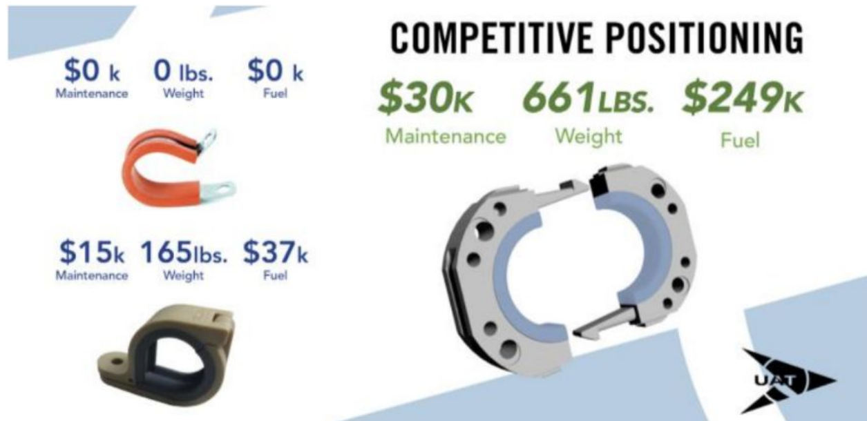
Figure 5. Competitive advantage.

clamps is not trivial. On December 29, 2000, for example, a Delta Airlines aircraft flight 219 (L1011) had an electrical fire due to electrical arcing of the windshield heat wire bundle. The cause of the electrical arcing was an Adel clamp damaging wires in and a 30-wire bundle. Twenty of the 30 wires were observed burned. The repair costs of the many systems these clamps support can be enormous. Figure 5 shows the advantage of the smart clamp over the competition on a Boeing 737 model.