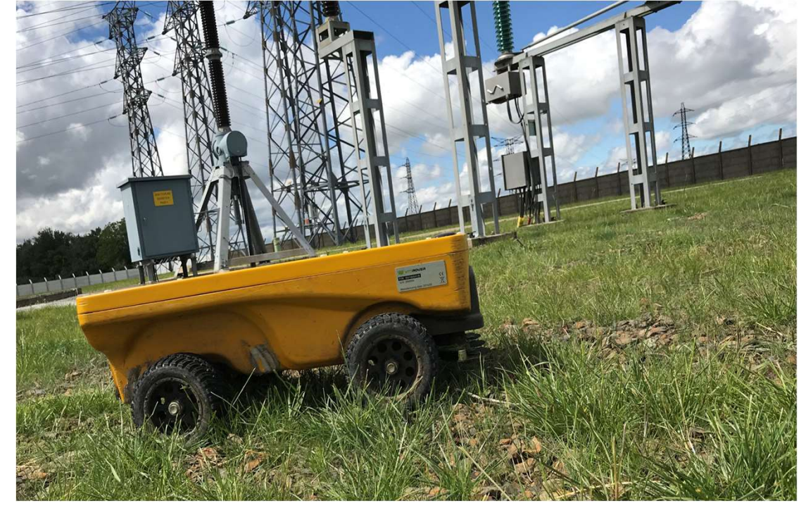
HIGHT VOLTAGE TRANSFORMERS